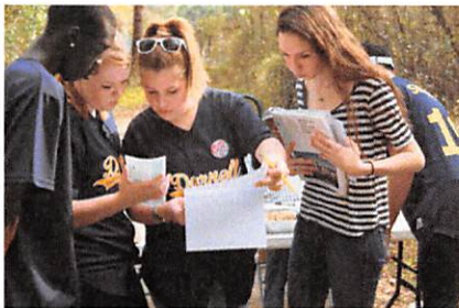
1. Students from Darnell-Cookman participate in the 2016 Envirothon at Tree Hill Nature Center

The Duval Soil and Water Conservation District (DSWCD) was created in September of 1955 under the authority created by the Soil Conservation Act, passed by Florida Legislature in 1937. The DSWCD was organized by concerned citizens of Duval County to help landowners and users to conserve land, water, forests, wildlife and related natural resources.