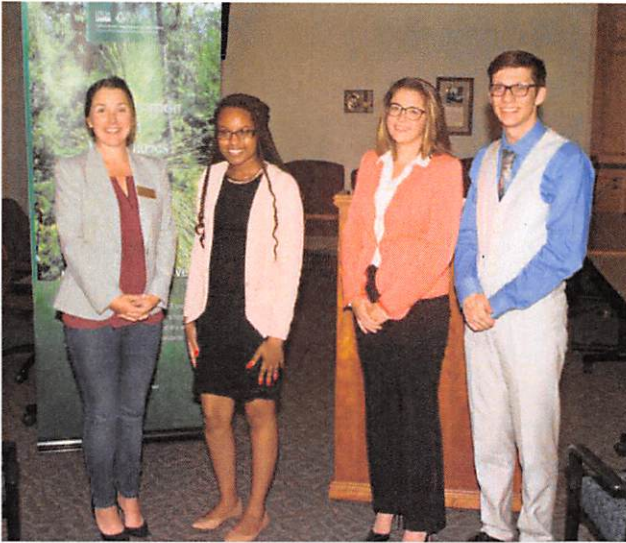
3. In 2016, the winner of the Duval County speech contest won the title of Miss Jacksonville and then Miss Florida Teen. Public speaking was a part of the competition

In Duval County, we give out prizes for the top 3 students, totaling $100 in the speech contest. Duval County has not hosted a poster contest in the last 3 years. The research and creative process in these competitions is invaluable. Many entries are not from students at public schools, but from home school students.