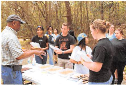
2. NRCS Soils and Land Use station where students are asked to identify and analyze several soils.

One of the most unique characteristics of the Envirothon is that it allows students, as they progress through the challenges, to understand and differentiate between local, state and national natural resources and environmental issues . The curriculum and study materials change based on the competition, as the environment itself changes. At the state and national level students compete for scholarship awards in various amounts each year.